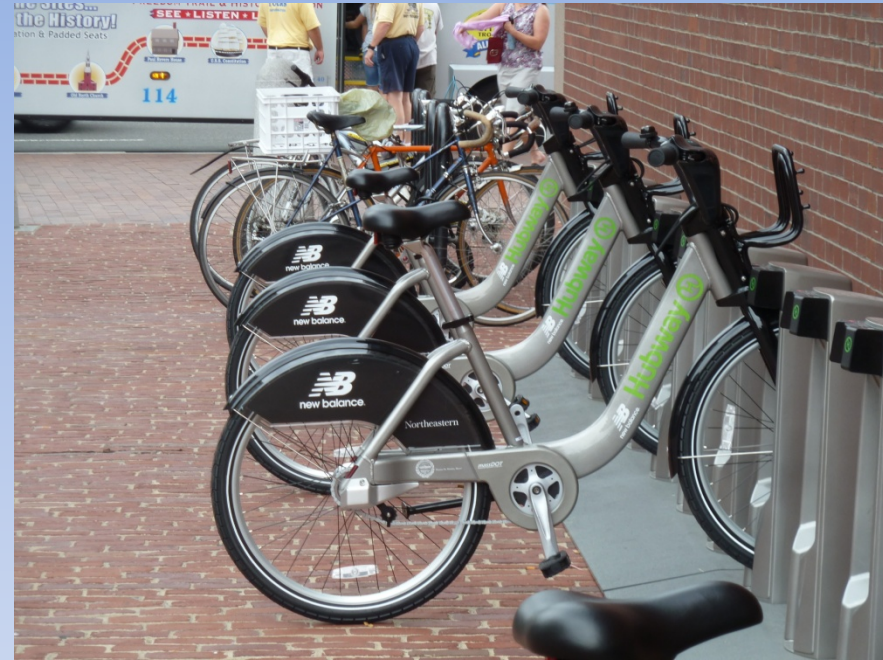
Hubway Bike Share Program