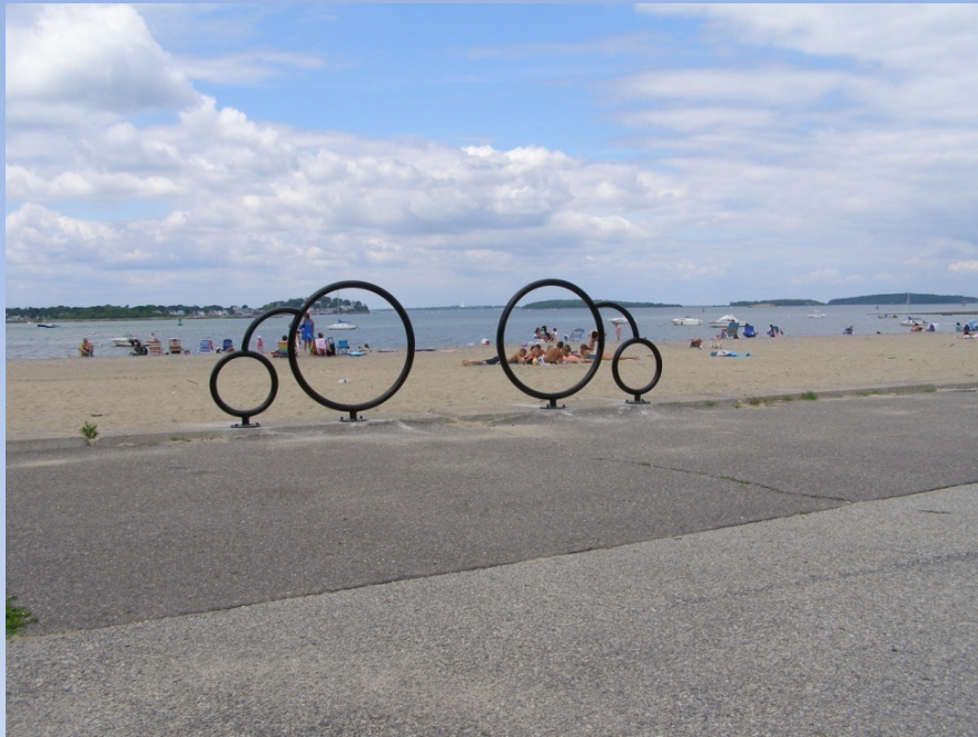
Regional Bicycle Parking Program