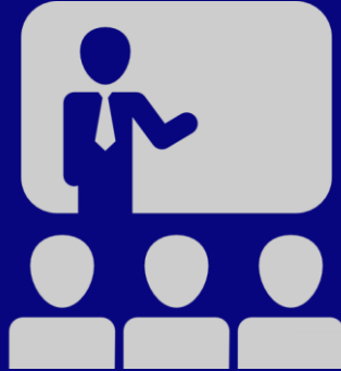
MPO Meeting Presentations