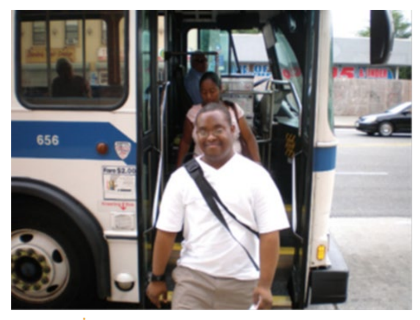
Boston MPO Coffee Chat 2022