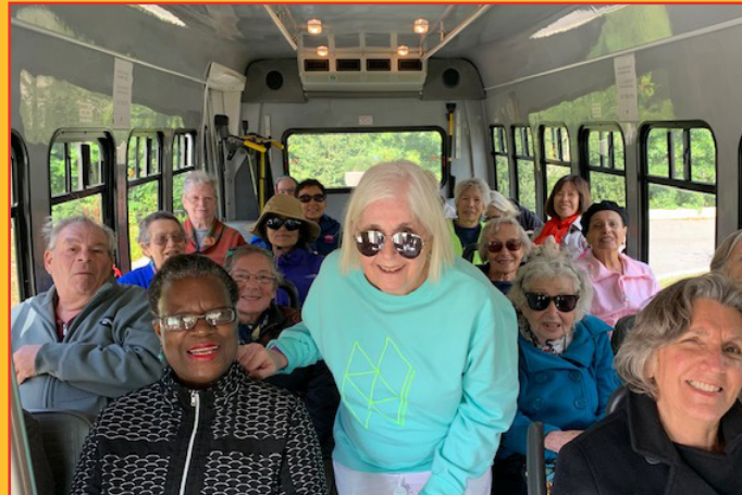
Operating a Successful Community Shuttle Program Guidebook