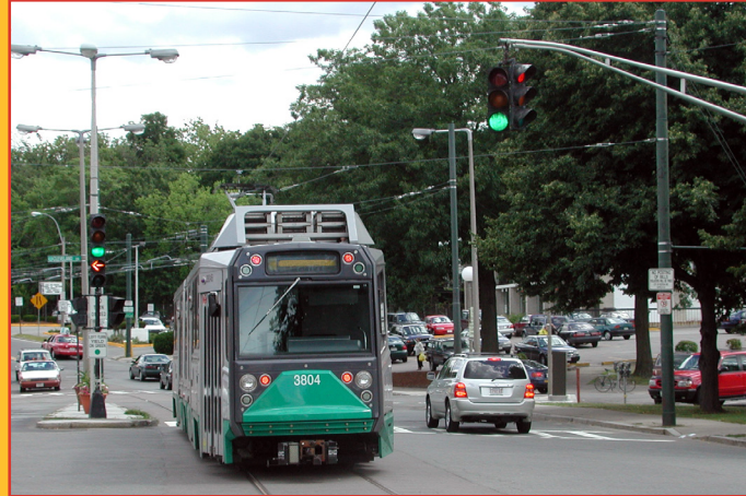
Transit Signal Priority Guidebook

The Boston Region MPO envisions a modern, well-maintained transportation system that supports a sustainable, healthy, livable, and economically vibrant region. To achieve this vision, the transportation system must be safe and resilient; incorporate emerging technologies; and provide equitable access, excellent mobility, and varied transportation options.