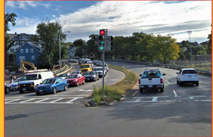
Route 16 Priority Corridor Study, Chelsea and Everett, Massachusetts