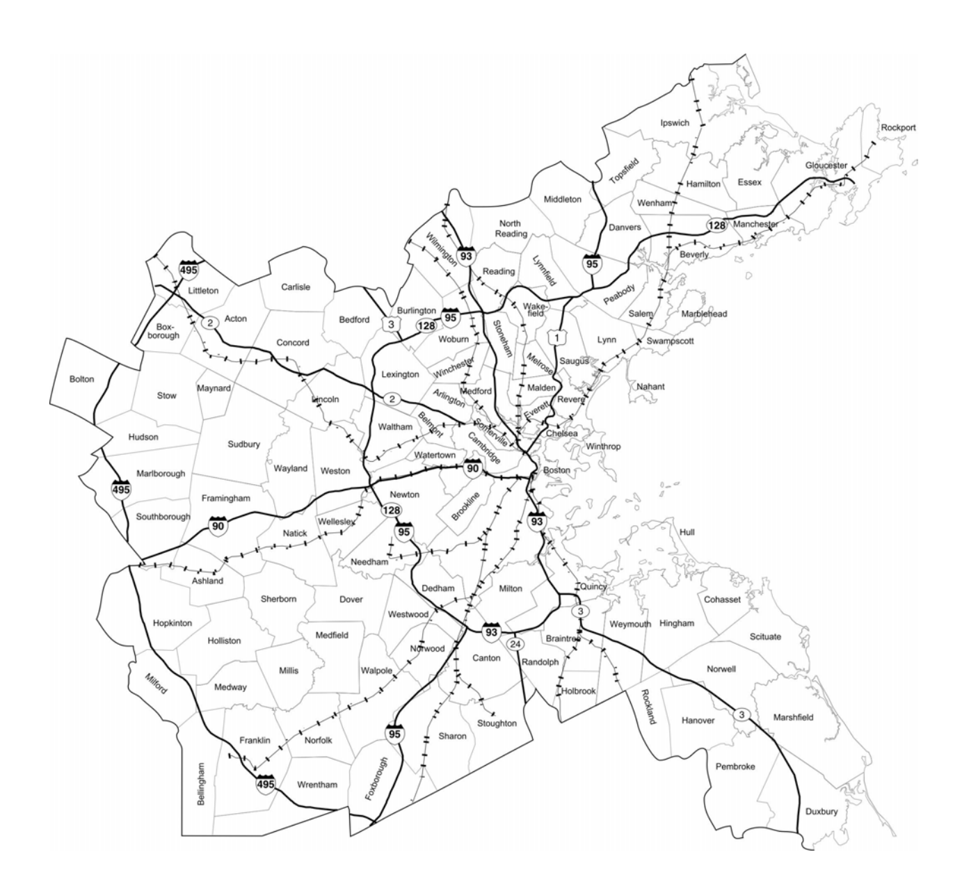
Figure 1.1. Boston Region MPO: Municipalities and Regional Transportation Corridors