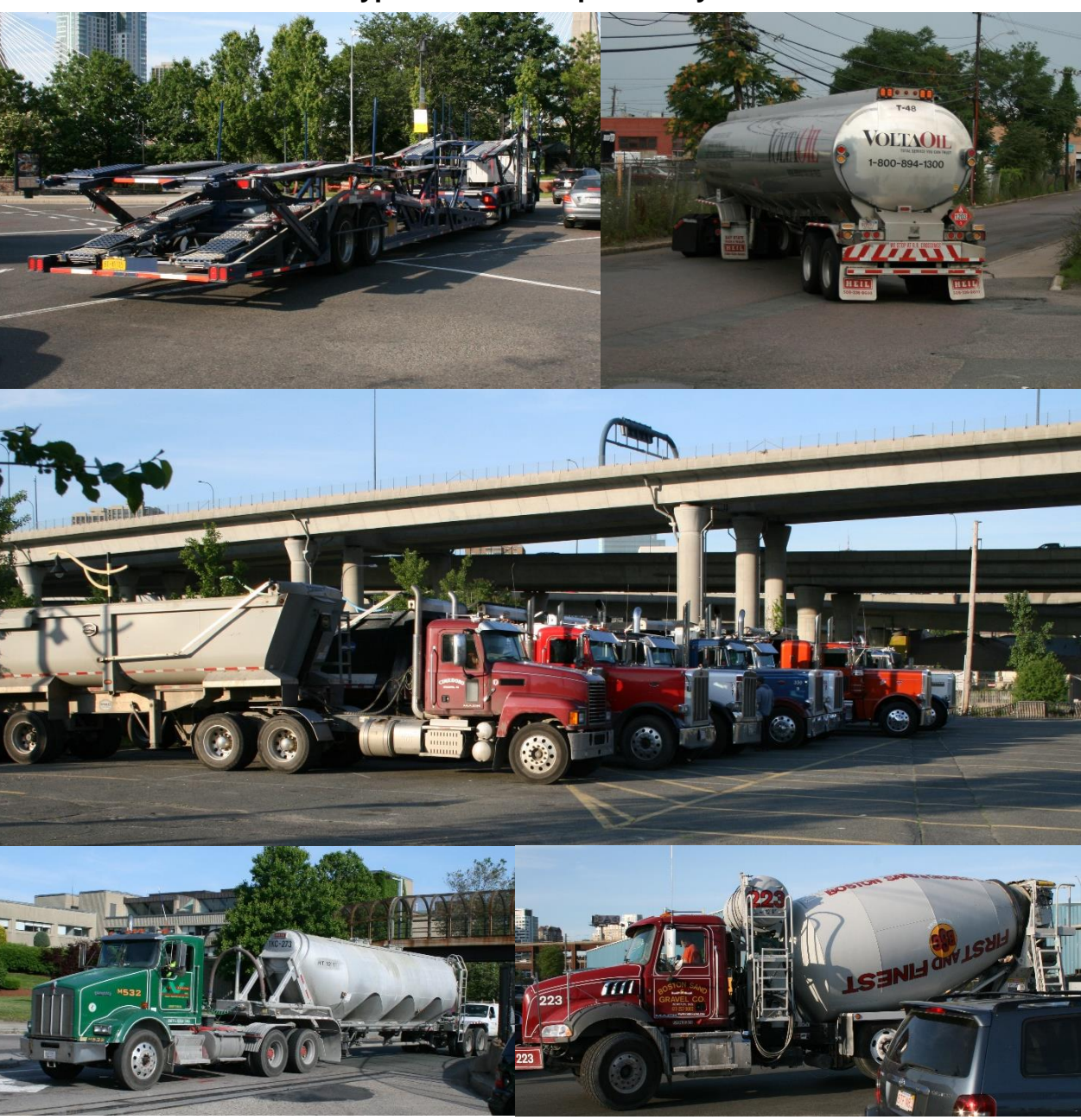
Figure 9 Truck Types that were Specifically Counted