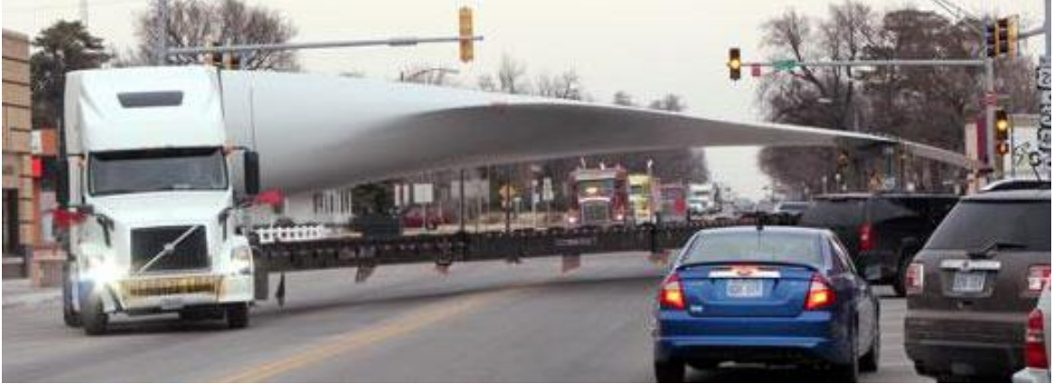
Figure 11 Oversized Loads: Delivering a Wind Turbine Blade

Turbine blades can be delivered to the testing center by water but most arrive by road. These are oversized loads and deliveries are made at night, approaching Boston on I-93 southbound, exiting at Sullivan Square, and traveling on the study corridor to City Square and then to the testing center via Chelsea Street. The turbines travel with a police escort that blocks traffic at intersections, and the turbine moves nonstop. The difficulty of moving cargo of this size can be seen in Figure 11, which shows a production turbine blade being delivered for installation at a location in Kansas.