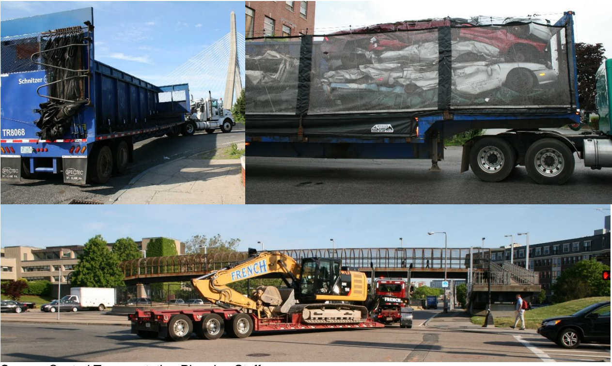
Figure 7 Other Semi-Trailer Trucks