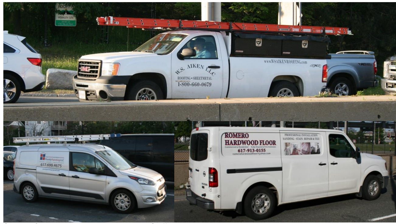
Figure 3 Light Commercial Vehicles