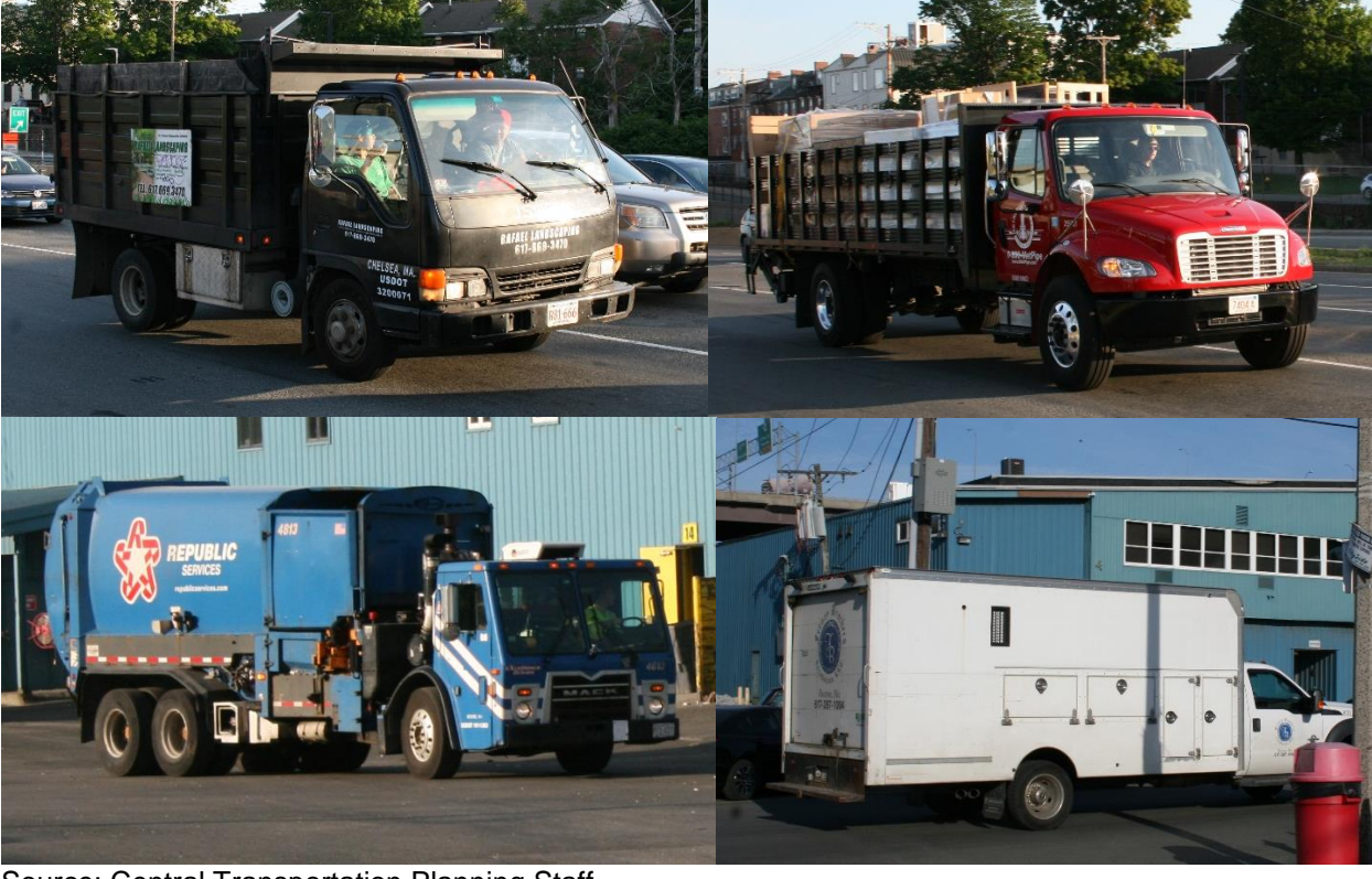
Figure 6 Other Single-Unit Trucks

Source: Central Transportation Planning Staff.