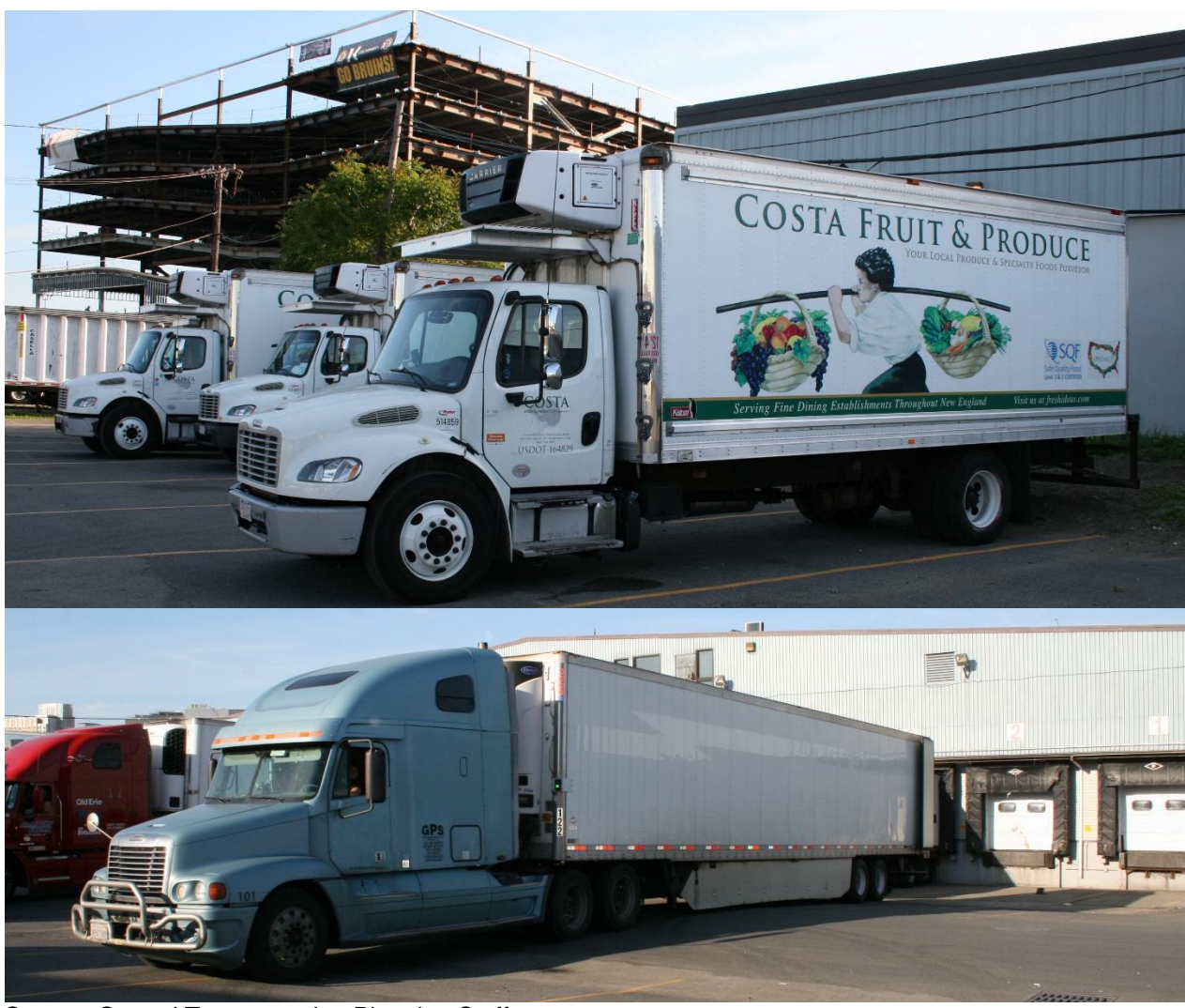
Figure 5 Refrigerated Trucks: Single-Unit and Semi-Trailer