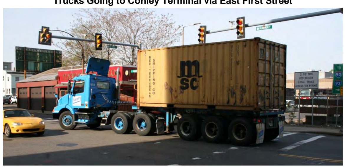
FIGURE 11 Trucks Going to Conley Terminal via East First Street