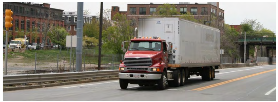
FIGURE 4 Box-Type Semi-Trailer (Unrefrigerated)

These trucks show a small net flow into the cordon area during the morning, and then a net outflow from midday on. By the evening peak period their numbers have dropped to 10 or 11 trucks per hour, about one-quarter of the 41 trucks during this period of their single-unit counterparts.