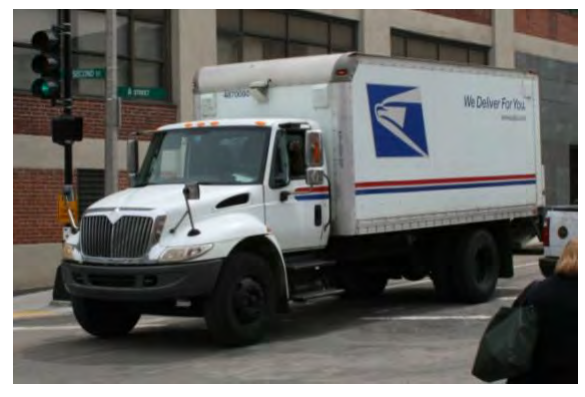
Entering Cordon Area on A Street