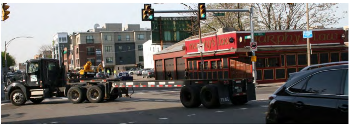
An Empty Chassis