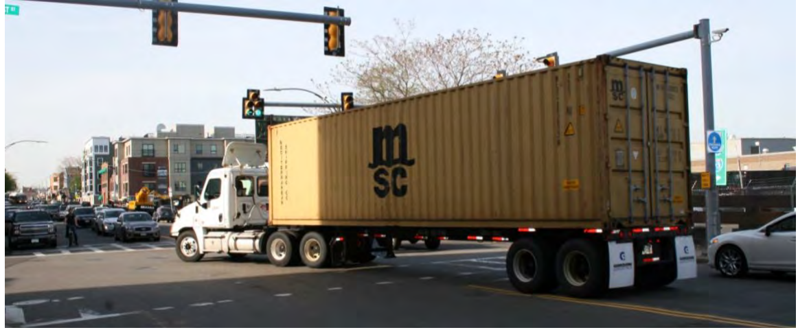
A 40-foot Ocean Container