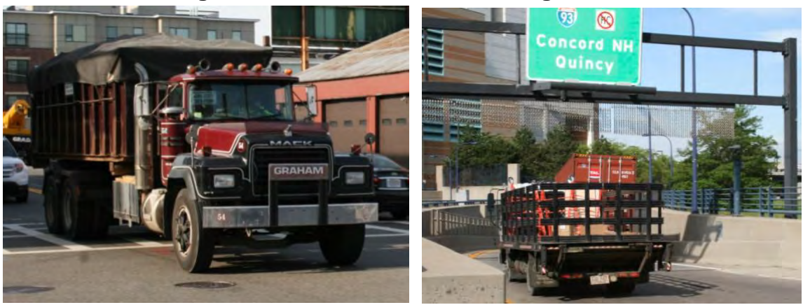
FIGURE 7 Single-Unit Trucks with Other Configurations

Many of these trucks support the building trades, much of whose activities are concentrated towards the early part of the day and taper off before the evening rush hour. Interestingly, the South Boston Waterfront is both home to a number of companies in the building trades as well as the site of substantial construction activity. Considering this group altogether, however, more of these trucks are leaving the cordon area in the morning and returning in the afternoon than the other way around, which illustrates that the Waterfront provides important support to the building trades.