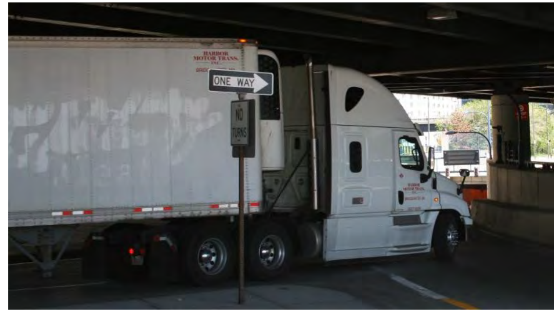
FIGURE 6 Refrigerated Semi-Trailer

This truck group illustrates another advantage of Bypass Road for waterfront access. Bypass Road connects with I-93 and some nearby industrial locations at an intersection complex that requires passing through one or more signals. Yet far more trucks use Bypass Road than use the direct ramps to and from I-93. Almost twice as many trucks leave via Bypass Road than via the direct I-93 ramp that goes both north and south. The I-93 ramps connect with the busy intersection of B and Congress Streets, whereas Bypass Road connects with an older road, the Massport Haul Road, which avoids several busy intersections on its way to the Boston Marine Industrial Park and other industrial locations.