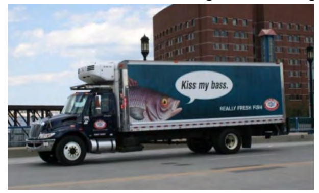
FIGURE 5 Single-Unit Refrigerated Trucks

These trucks show a net flow out of the cordon area from morning until afternoon. The net flow reverses in the afternoon, with a substantial number of trucks returning to the cordon area during the evening peak period, which perhaps reflects the distances associated with regional distribution.