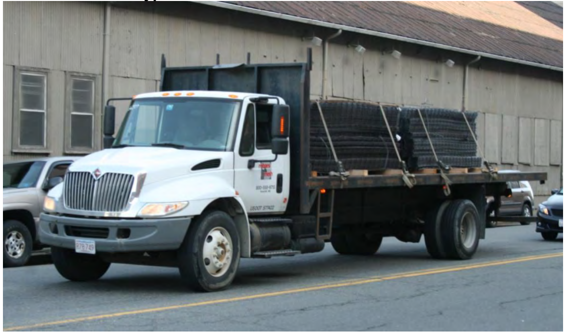
FIGURE 2 Typical Truck with Doubled Rear Wheels

Another practical benefit of the six-wheel definition is the ease of truck identification. For the traffic tabulator in the field, the presence of six wheels is clear and unambiguous, as illustrated in Figure 2. If a non-passenger vehicle has six wheels, it is a truck. If it has four wheels, it is not, regardless of markings or vehicle body type.