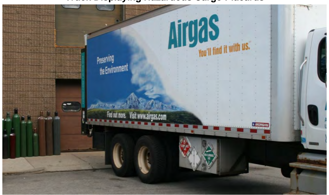
FIGURE 9 Truck Displaying Hazardous Cargo Placards

Very few tank trucks are seen in the cordon area. Single-unit tank trucks are most often seen delivering home heating oil, but during a set of Bypass Road counts performed in winter 2013–2014, staff observed few of them (home heating oil is not widely used in the cordon area). Some tank trucks, however, refuel heavy equipment working at construction sites. The few observations of trucks of any configuration with hazardous cargoes are summarized in Table 10.