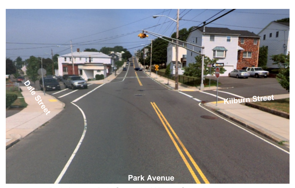
Park Avenue, Dale Street, and Kilburn Street intersection

The City of Revere requested technical assistance from the Boston Region Metropolitan Planning Organization (MPO) to review pedestrian safety improvements proposed for the intersection of Park Avenue, Dale Street, and Kilburn Street. Motorists turning left from Park Avenue onto Dale Street drive at high speeds because of the diagonal alignment of Dale Street, increasing risk to pedestrians in this intersection. The city is proposing construction of a traffic island on Dale Street to reduce the speed of vehicles turning from Park Avenue westbound. This purpose of this memorandum is to review this proposal; it includes an overview of the study location, issues and concerns, existing conditions, and refinements to the city's proposal.